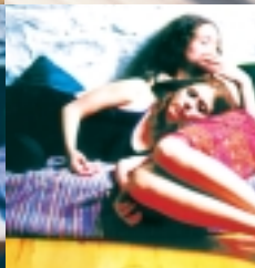
fourteen new songs from songwriter tom sheehan